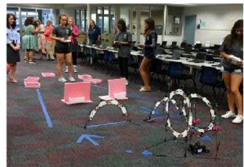
West Shore Jr. High's "Whirly Girls" Teach running their drones through the course.