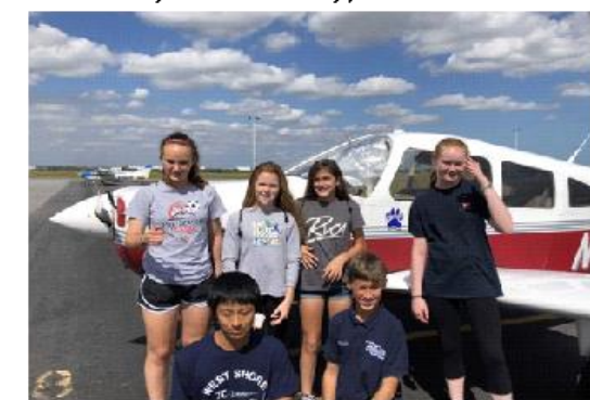
West Shore's Robotics Team conducts field trip to Florida Institute of Technology (FIT)

evidence of her work to inspire young women to pursue STEM studies, was her recent trip to the Air Force Technical Application Center (AFTAC). There she had 8 th and 9 th grade young ladies take part in the Women in Science and Engineering Symposium (WiSE) for a STEM Pioneer Hands on Day. Her students have even traveled to Europe to compete in the Monaco Mousetrap Grand Prix Finals; placing second as they were up against teams from France, Italy, and Monaco.